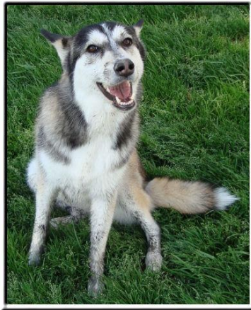
Pet Harbor's Mardi enjoys digging

NATIONAL ADOPTION: Sat, Sept 10 & Sun, Sept 11 Sat, Nov 11 & Sun, Nov 12 10:00 A.M. – 4:00 P.M. Massaponax PetsMart