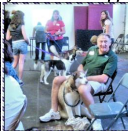
PH adopters with their dogs. Dogs front to back Rozco, Casey (now Sadie) & Mardi.