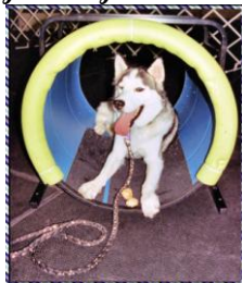
PH alumnus Duger (now Kit)

Pet Harbor was born on March 6, 2000. On September 18, 2010, we held our 10-year reunion in Stafford, Virginia. It was such a fantastic time. It was especially great seeing the PH alumni. To avoid paperwork confusion, PH tries very hard not to repeat names. We've had one Dakota. Funny thing is he was not a Siberian Husky. Back in the beginning we took in other breeds. Dakota was likely a Russian Wolfhound-Ferrier mix. One month after the reunion, Dakota went to the Rainbow Bridge. We are so grateful we got to see him one last time. The reunion is probably best memorialized in the photos & thank you notes. If you or your thank you note don't appear, it's simply due to lack of space.