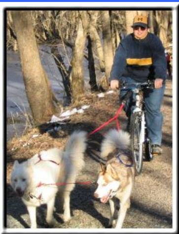
Biking with Yorka & Misha (formerly Pet Harbor's Ross)

If you need further ideas, e-mail us at info@petharbor.org.