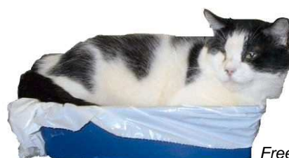
Freedom, Pet Harbor alumnus, enjoys his litter box!