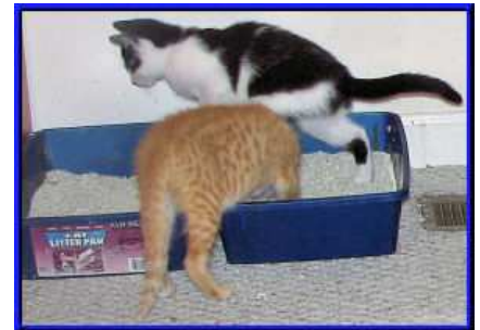
Kirby (available for adoption) & Ping

PROFESSIONAL HELP. If all else fails, visit your public library for a kitty behavior book or ask your vet for a referral to a kitty behavioral specialist. There are natural remedies & other medications available to help kitty (and you) through stressful periods if necessary as well. If you adopted kitty from Pet Harbor, call us & we'll put on detective hats & help solve your kitty's caper.